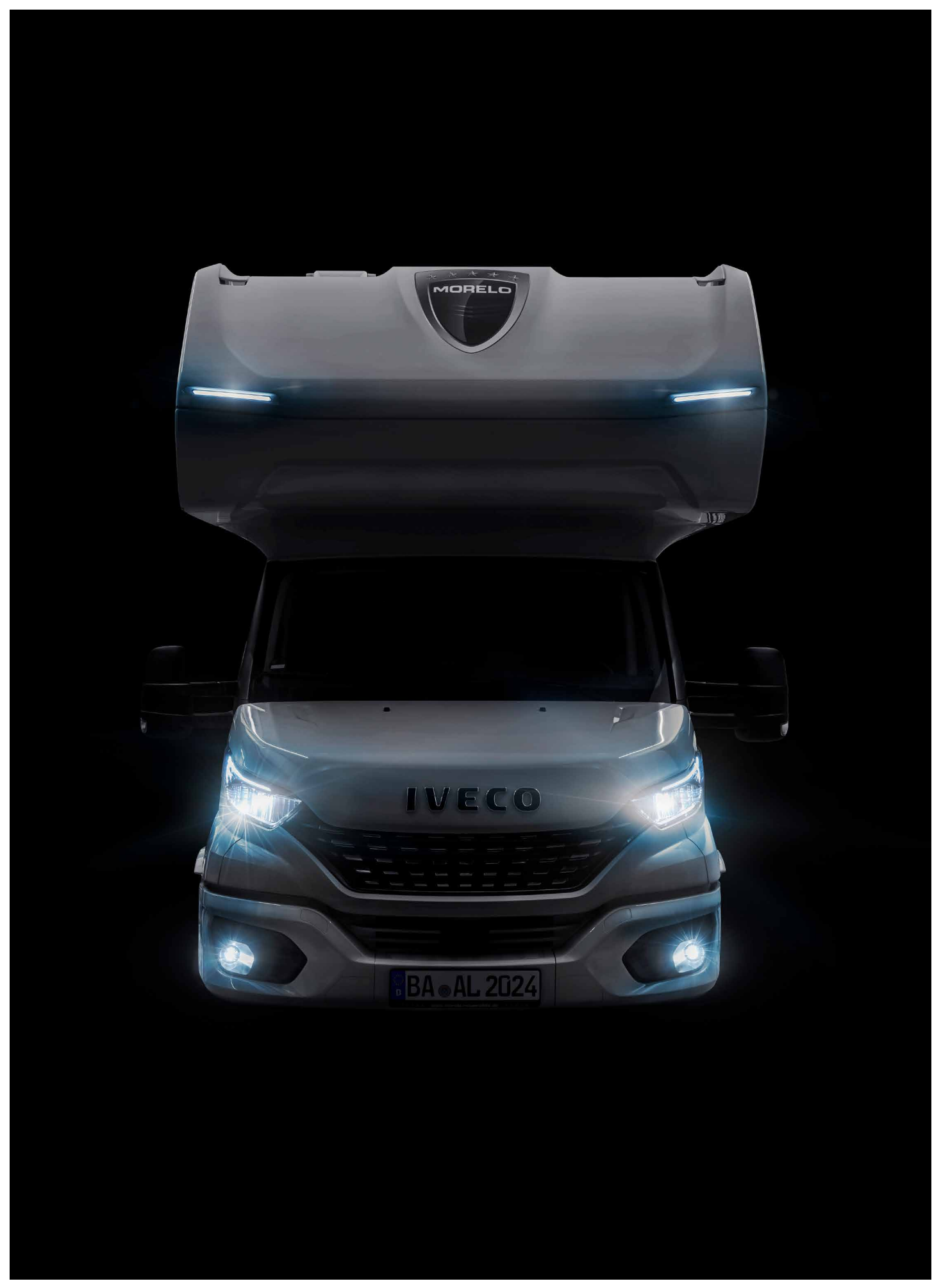
Our lighting concept of LED daytime running lights and modern headlights offers good visibility at all times.