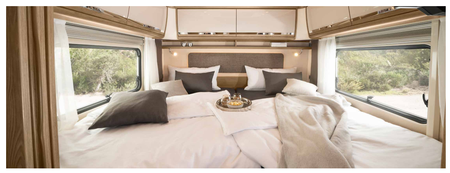
{\sf Beds\ with\ multi-zone\ mattress,\ including\ comfort\ slat\ base\ and\ adjustable\ headboard}

177 litres compressor refrigerator with separate freezer compartment, dark-mirrored fridge door