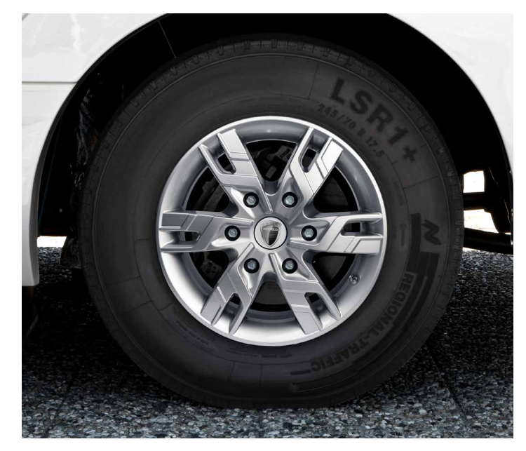
Light metal rims MORELO Silver