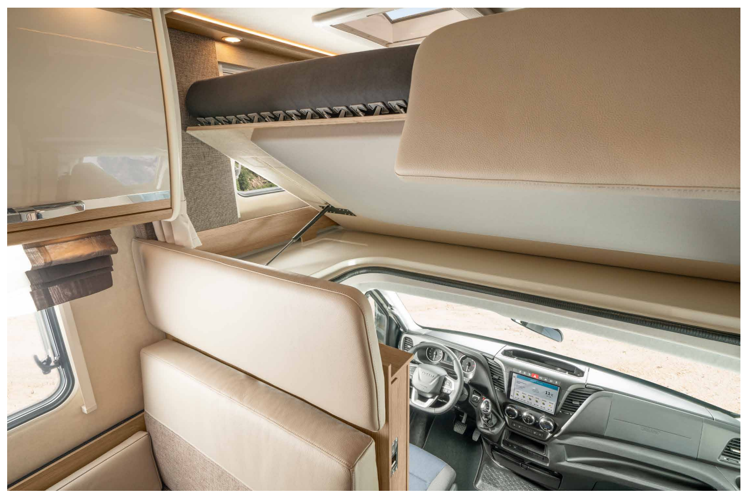
Comfortable access to the cockpit