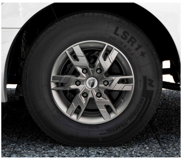
Light metal rims MORELO Graphite