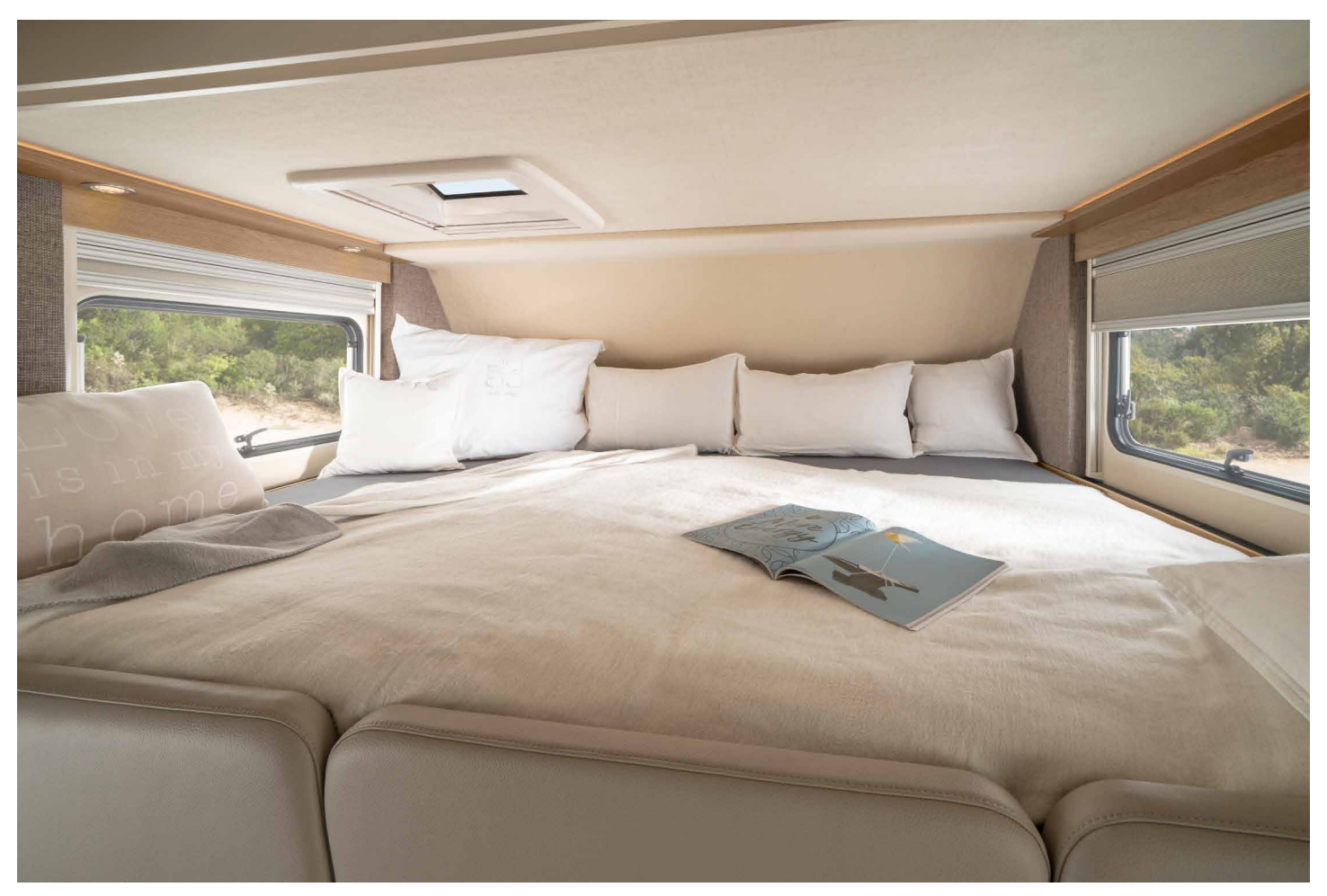
Alcove bed from PALACE A 94L