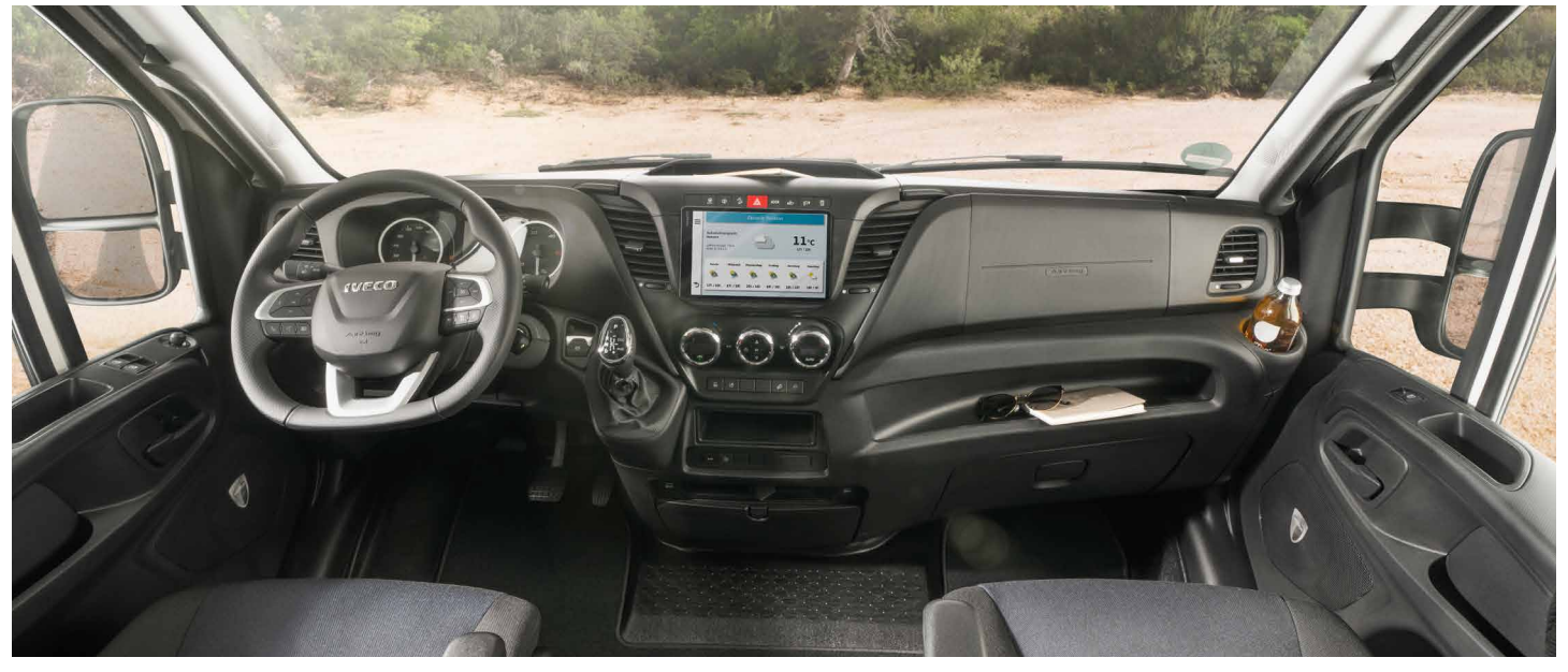
MORELO PALACE ALKOVEN cockpit with optional 8" navigation system