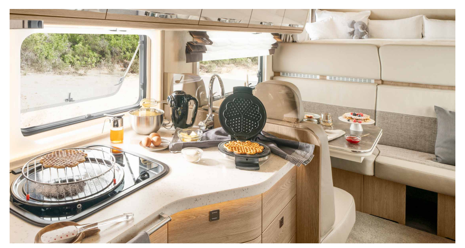
Kitchen from PALACE ALKOVEN 94 L